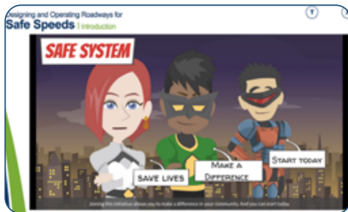
A screen capture from the self-paced Designing and Operating Roadways for Safe Speeds course.

The " Designing and Operating Roadways for Safe Speeds " online course delivers free, self-paced training that provides learners with the knowledge and skills they need to design safe roads effectively, set safe speeds, and select treatments that mitigate crash severity. Participants will learn how incorporating innovative design concepts and new approaches to setting speeds—such as self-enforcing roadways, target speed, and injury minimization—can reduce the likelihood of fatal and serious injury crashes for all roadway users. To register, or to learn more, visit the National Highway Institute (course number: FHWA-NHI-380128).